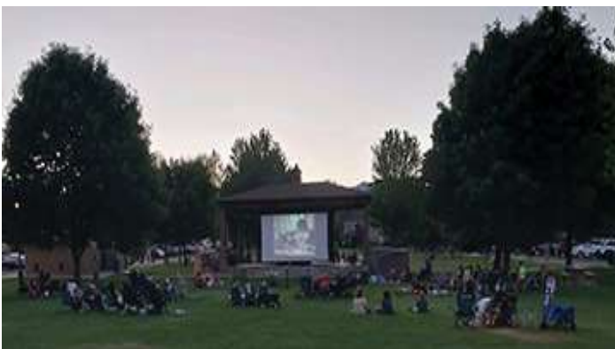
Honey I Shrunk the Kids 2023

Join us for the 19th season of Movies in the Park. The first movie will be on June 13, 2025. Bring your blanket or sand chair and bug repellent. The movie starts at dusk. Please check the town website in April for the movies to be shown. Some movies are not appropriate for all ages, so please check the rating. We provide a rating link for each movie.