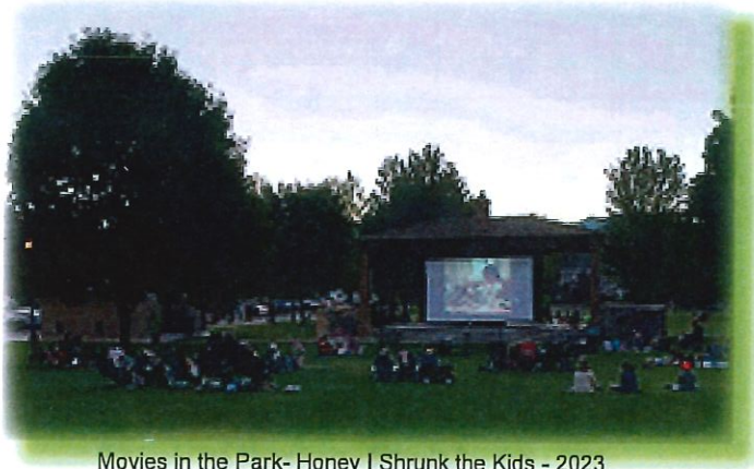
Movies in the Park- Honey I Shrunk the Kids - 2023

Movies in the Park started on June 14 with the movie Star Wars: Return of the Jedi . July 19th will be Super Mario Brothers ; and August 16th is Barbie .