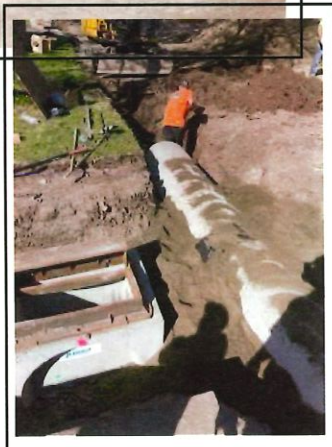
(New Concrete Pipe)