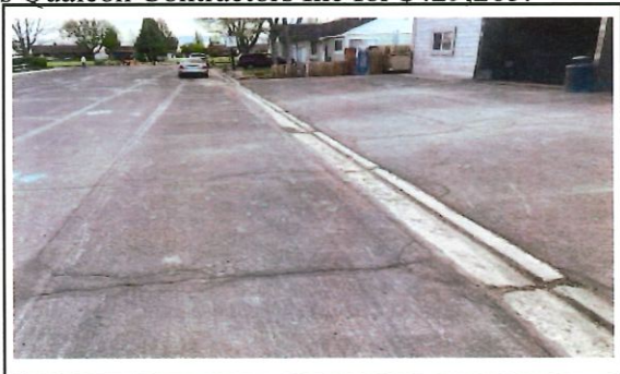
(old south curb – no sidewalk looking east)

This project was completed in June of 2022 and Bell Street is now a "thing of beauty." The project removed the deteriorated storm drain pipe under the roadway, installed ADA compliant sidewalk ramps, extended the sidewalk along the south side of the street, and repaired damaged curb, gutter, and sidewalk as well as removing all existing pavement and replacing it with new pavement. NV Energy removed the existing stainless-steel streetlight and the Town installed a decorative street light. The Town's estimate for the project was $320,000. Two bids were received and the low bid was Qualcon Contractors Inc for $429,265.