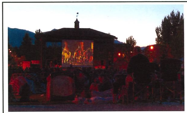
Movies in the Park- How to Train Your Dragon 2011

Movies in the Park started on June 22nd with the movie Star Wars: A New Hope ; July 8th, Maleficent ; July 29, The Rookie ; and August 12, Jumanji (1995).