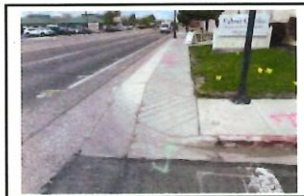
(Old Sidewalk Ramp)