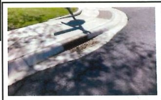
(New Catch Basin)