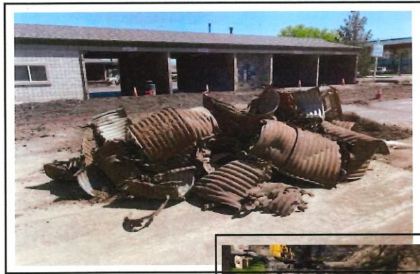
(Old Metal Pipe))