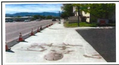
(New Valley Gutter & Sidewalk Ramp)