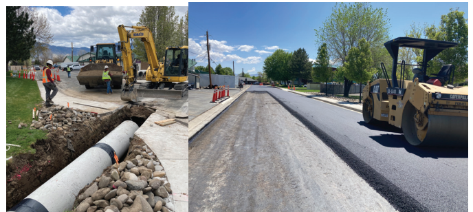
CEMETARY LANE PROJECT 2021

The Town must install a storm drain system from the underground detention reservoir constructed in February of 2020 from the Gardnerville Station to the Martin Slough. When the Nevada Department of Transportation (NDOT) reconstructs US Highway 395 they are going to install storm drains into the Town’s underground detention reservoir. The Town must then install a storm drain network from the underground detention reservoir to the Martin Slough. NDOT was originally going to reconstruct US 395 in Spring 2022 but that has been delayed until Spring of 2024 and additional delays would not be surprising. The project is completing the permitting phase and funding has been set aside, however the Town is not urgent to complete the project prior to NDOT’s connection to the reservoir. The Town is also hopeful the Federal APRA Funding can be used to complete the project and the Town can save the money it has set aside for construction. This project is in the “waiting phase” as schedules and funding align. Estimated cost $250,000.