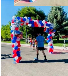
Freedom 5K Fun Run 2021