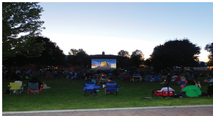
Movies in the Park 2019 - Night at the Museum 2