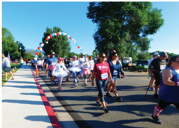
Freedom 5K Fun Run 2019