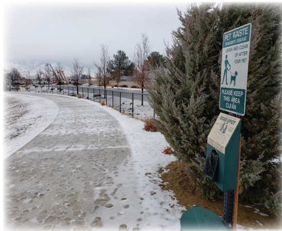
K-9 Korral/Carrick Pond

walk maintenance. We look forward to doing even more in the future. The K-9 Korral, the only Town Park to permit dog use, gained approval by Douglas County Community Development and was improved with a fence around the perimeter. Three additional projects will start construction in mid-January including; three hundred