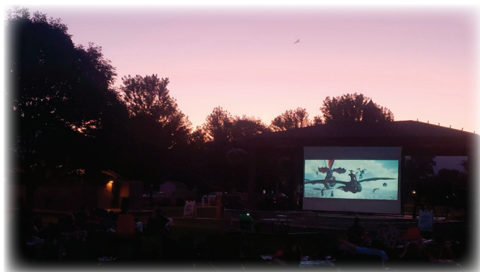
Movies in the Park 2019 - How to Train Your Dragon - The Hidden World

Join us for the 15th season of Movies in the Park. The first movie will be on June 26, 2020. Bring your blanket or sand chair and bug repellent. The movie starts at dusk. There will be limited concessions available at the park. Please check the town website in April for the movies to be shown. Some movies are not appropriate for all ages, so please check the rating. We provide a rating link for each movie.