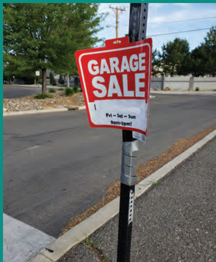
Garage Sale Signs

Arbor Day 2019 – The Arbor Day Celebration planted 2 Northern Catalpas in Heritage Park this year. Cub Scout Troop 8583 and Girl Scout Troops 287 helped with the event bringing out over 30 children to plant the trees and learn about the importance of trees in our area. The Town has a Certified ISA Arborist on staff to maintain our 700+ town trees.