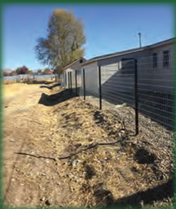
Fence at Hellwinkel Channel

Southgate Drive was reconstructed with a base section, new paving and striped to last for years to come. Additionally, the entrance portion of South Industrial Way was reconstructed as well. Both projects eliminated the areas that were consistently generating pot holes and the pavement was rapidly deteriorating.