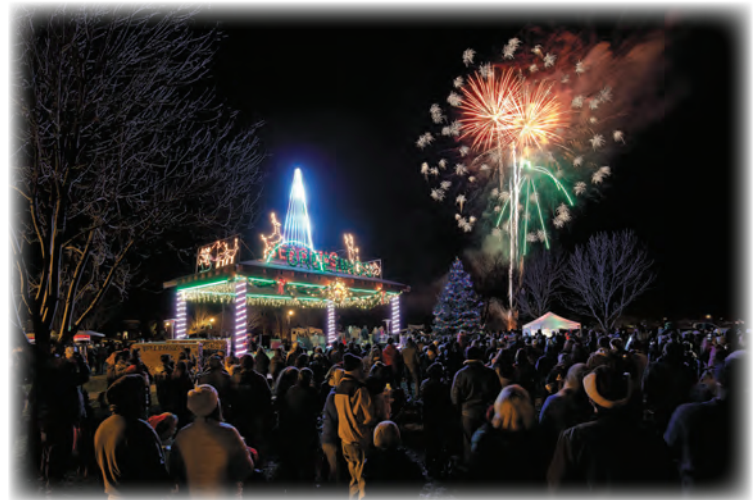
2017 Christmas Kickoff

Thanks to this year's sponsors: Sharkey's Casino & Gardnerville Health & Sanitation.