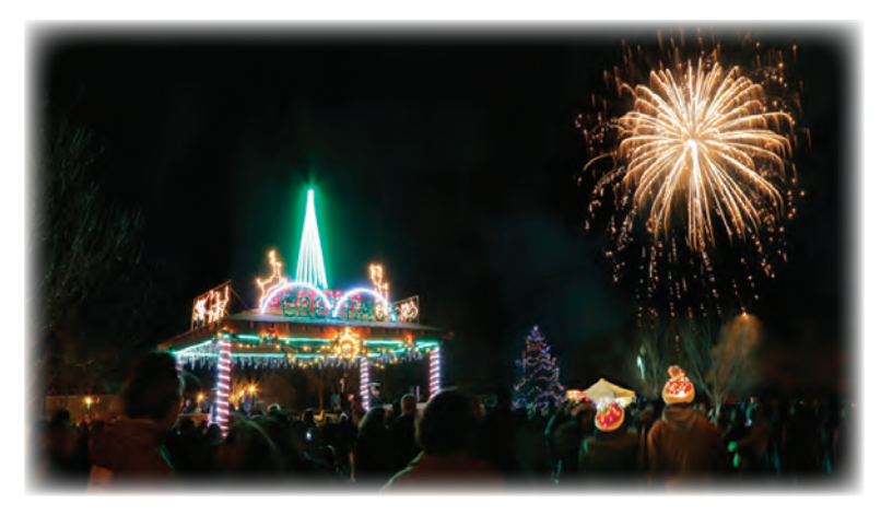
2016 Christmas Kickoff

Thanks to this year's sponsors: Gardnerville Health & Sanitation, Sharkey's, Peri Enterprises, Stage Stores (Bealls)