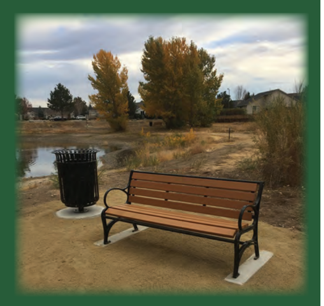
Eagle Scout Project