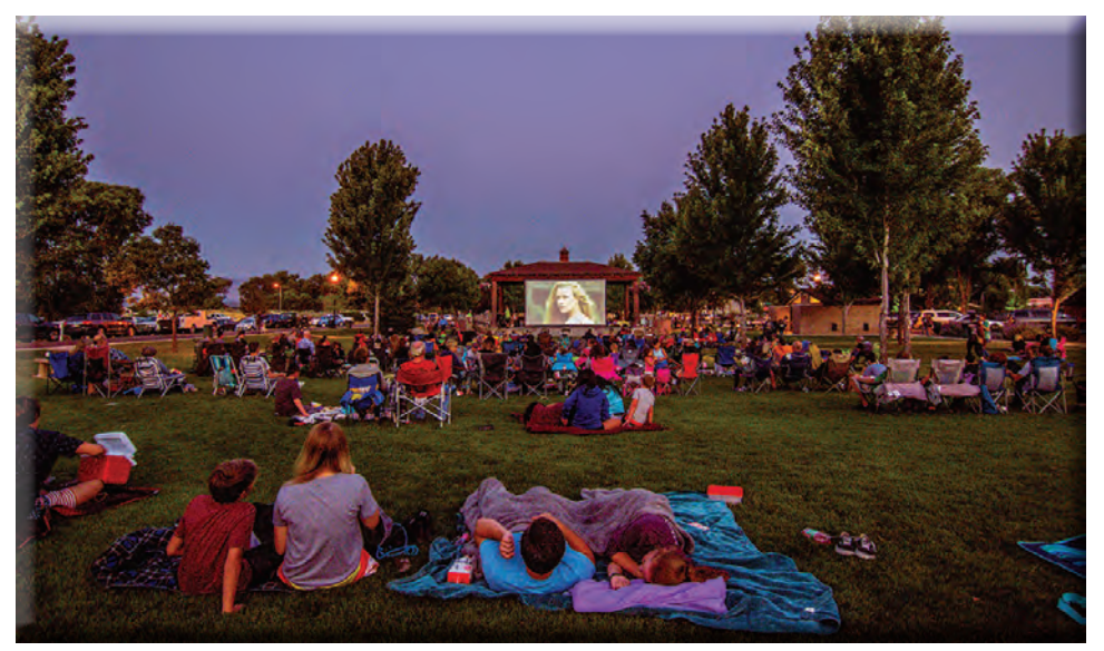
Princess Bride - 2017