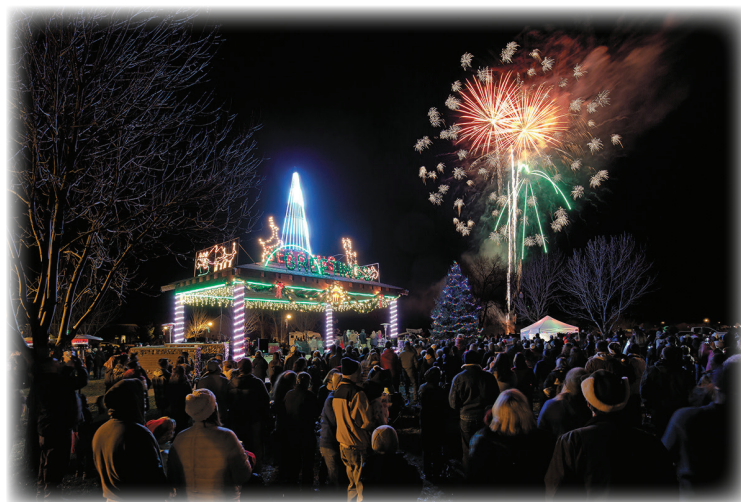
2017 Christmas Kickoff

Thanks to this year's sponsors: Sharkey's Casino & Gardnerville Health & Sanitation.