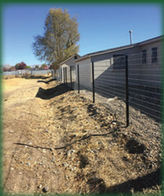
Fence at Hellwinkel Channel

Southgate Drive was reconstructed with a base section, new paving and striped to last for years to come. Additionally, the entrance portion of South Industrial Way was reconstructed as well. Both projects eliminated the areas that were consistently generating pot holes and the pavement was rapidly deteriorating.