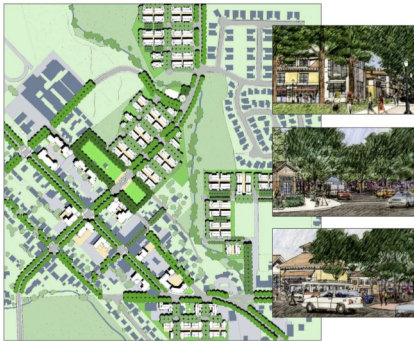
November 14, 2005 Administrative Draft

The Towns of Gardnerville and Minden need your help to update the Plans for Prosperity.