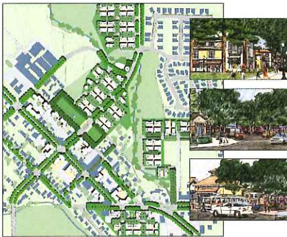
November 14, 2005 Administrative Draft

The Towns of Gardnerville and Minden need your help to update the Plans for Prosperity.