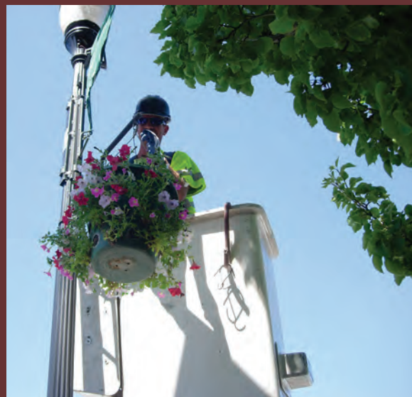
Flowers going up on Main Street