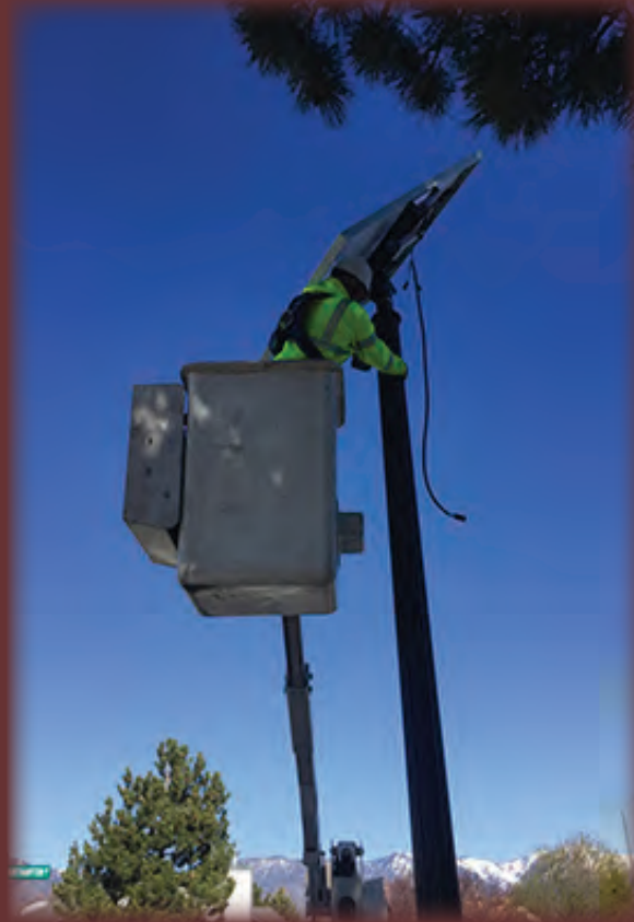
Northampton Solar Light

US Highway 395 has color up again this year from continued public support. Flower baskets were installed on the light poles along the Main Street District on June 1. Baskets were paid for by private residents and businesses to beautify the downtown area. Keep an eye out for our Town Staff that will be watering twice a day to keep them colorful.