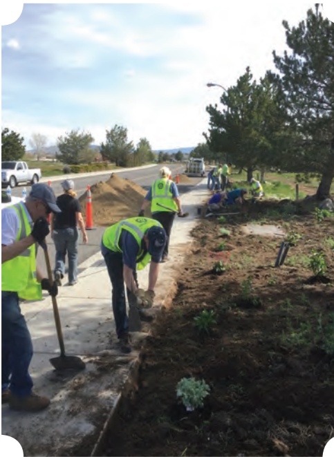
Rotary Club Project

It's been called "white death," "the silent killer," and "car eater." Its real names are sodium chloride, rock salt or de-icing salt. By whatever name, the topic of deicing salt has been called by one official in the Environmental Protection Agency, "a classic environmental problem that seeps through the cracks." Salt poses a threat to trees and shrubs to say nothing of structures, concrete, water resources and even human health. Fortunately there are ways to fight icy sidewalks and driveways while at the same time spreading less salt. As a property owner, landscaper or grounds worker when possible clear snow by shovel, blower or blade before it becomes compacted