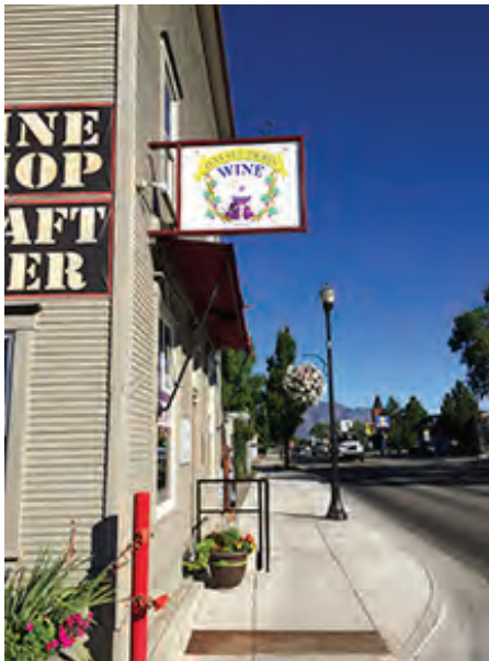
Battle Born - Main Street

For 35 years, Main Streets across the country have been doing important work, dedicating themselves to improving the quality of life in their communities and preserving the unique heritage of their downtowns and commercial districts. While the Main Street movement is recognized in many circles as an important player in downtown revitalization, collectively, we see an opportunity to raise the profile of the work we do and the impact we have. Main Street Gardnerville (MSG) is the longest running Main Street program in Nevada. We are in our 8th year thanks to the support of the Town and the Community. With the exception of one paid staff member, we are an all-volunteer organization of approximately