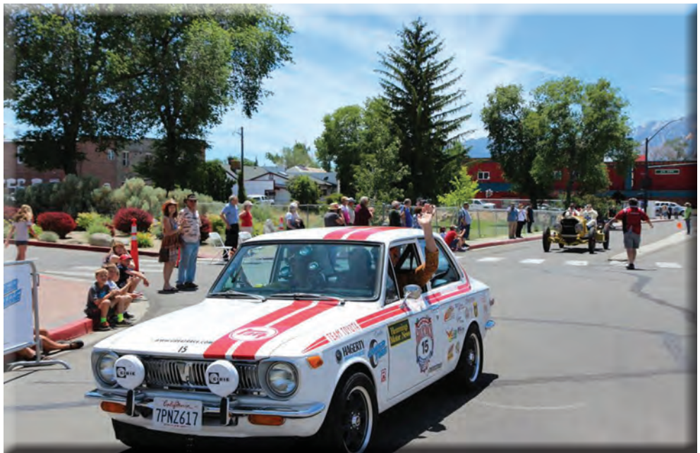
The Great Race 2016